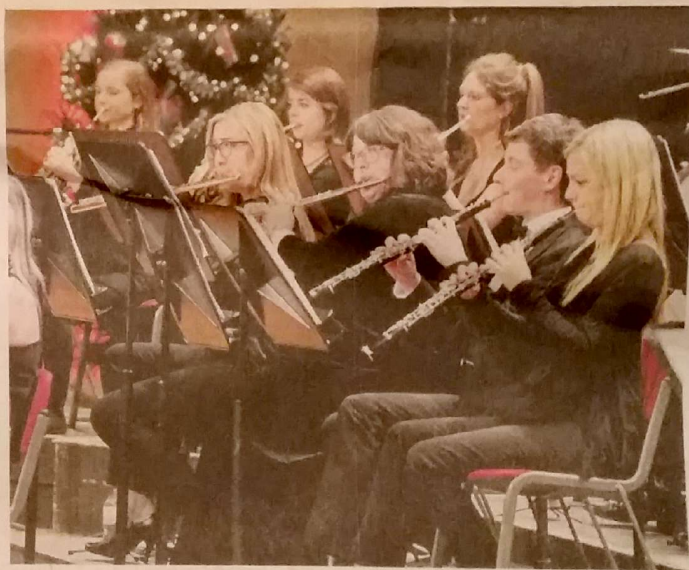
Woodwind and brass in full flow (16965207)